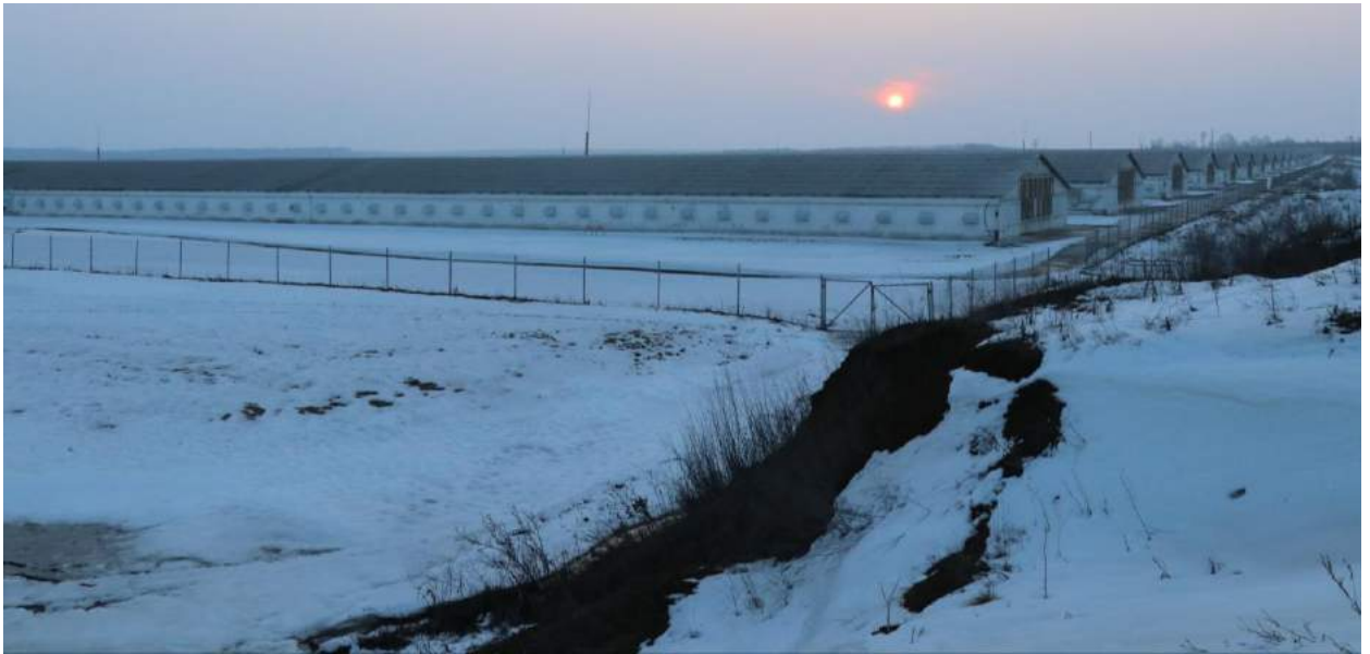
Existing poultry houses within the VPF.

The “overall project area” of Phases 1 and 2 of the VPF will use an estimated 27,000 hectares of land in the Vinnytsia Oblast between and surrounding our communities. 19