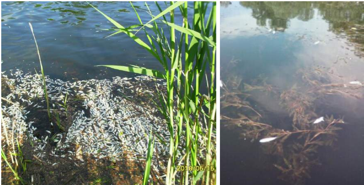
Community members reported seeing dead fish floating in the river near the outflow pipe of the wastewater treatment. Source: Facebook (see further Annex 6).

about 10 meters from her land and without prior notice to her. 132 Recently, on 4 May 2018, the same community member again noticed Zernoproduct Farm spraying pesticides close to her residence and without prior notice. This recent incident was again raised through a phone call to MHP’s Corporate Social Responsibility team, and after that the spraying did eventually stop, but we fear such incidents may continue to occur. Community members fear that spraying of pesticides may lead to potential pollution of soil and groundwater, as well as unknown health impacts for local residents. Disposal of treated wastewater in the Pivdenny Bug River raises similar concerns. 133 For example, in May 2018 local community members noticed dead fish floating in the river near the outflow pipe of the wastewater treatment plant and we fear that this may have been related to the Company’s operations. 134