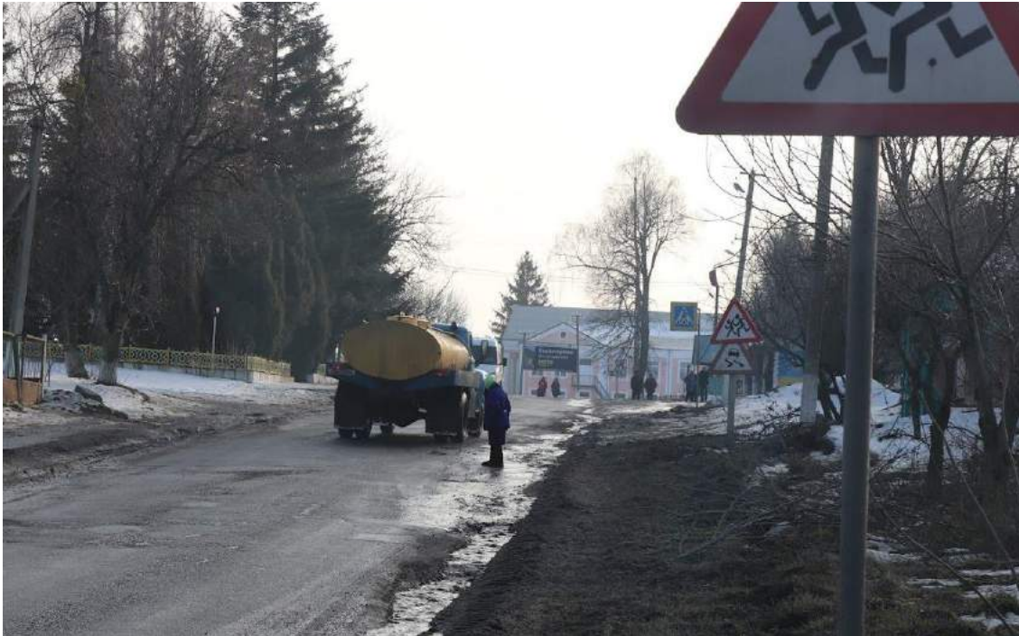
Large vehicles frequently utilize village roads creating risks to pedestrian safety and damage to physical property.

These impacts were particularly severe during construction, when heavy machinery traveled through the main road regularly. However, even after Phase 1 construction ended, heavy vehicles have continued to use the main road through Olyanytsya. In November 2017, we installed a video recorder to collect footage of the Olyanytsya main road for a full 7-day period. The footage shows an average of 400 MHP-related heavy vehicles traveling on the road each day, which accounted for approximately 70% of heavy vehicle traffic during the recorded period. 101