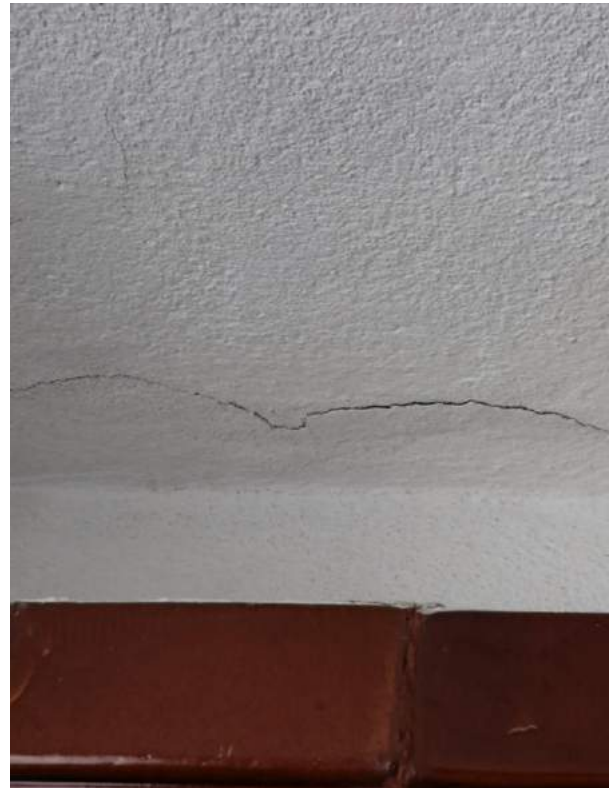
Cracks have appeared in recent years in residents' homes close to the road, both on building exteriors and along the walls and ceilings of interior rooms.

Impacts from MHP's heavy road use were foreseeable. In fact, MHP acknowledged them in meetings with community members in Olyanytsya in 2010. 102 Local residents have made numerous appeals for the immediate construction of the bypass road and other measures to address road impacts, dating back to 2012 or earlier. 103 In one such letter, community members in Olyanytsya again raised concerns about road impacts and presented a series of demands to MHP to address the issue, including construction of a bypass road, major road repairs, construction of sidewalks, speed limits, and an agreement not to construct any new brigades on Olyanytsya lands until these measures are carried out. 104 The Company and local officials agreed to implement all of the requested actions, 105 but to date, we have not seen any real progress.