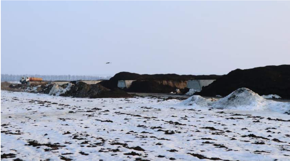
Chicken excrement lays uncovered in a manure storage facility.

trip in 2015, and recorded in the Black Earth report, published by CEE Bankwatch Network following that mission. 124