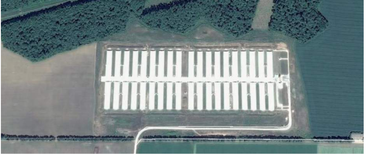
The typical brigade layout. Each brigade requires a total area of 25-30 hectares of land.