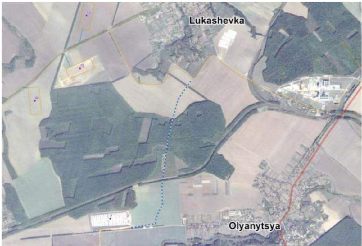
The planned Olyanytsya bypass is indicated by the blue dotted line.

In early 2015, as MHP was negotiating loans for the VPF expansion with the EIB, 106 and the EBRD, the Company developed a draft plan for a bypass road, but then progress stalled. 107 Construction has been delayed time and again for various reasons, despite continuing promises that it will be completed soon. 108 Meanwhile, the Company's construction of VPF Phase 2 facilities has continued on time. We interpret this as a prioritization of MHP's profit-making operations over the interests and wellbeing of local communities.