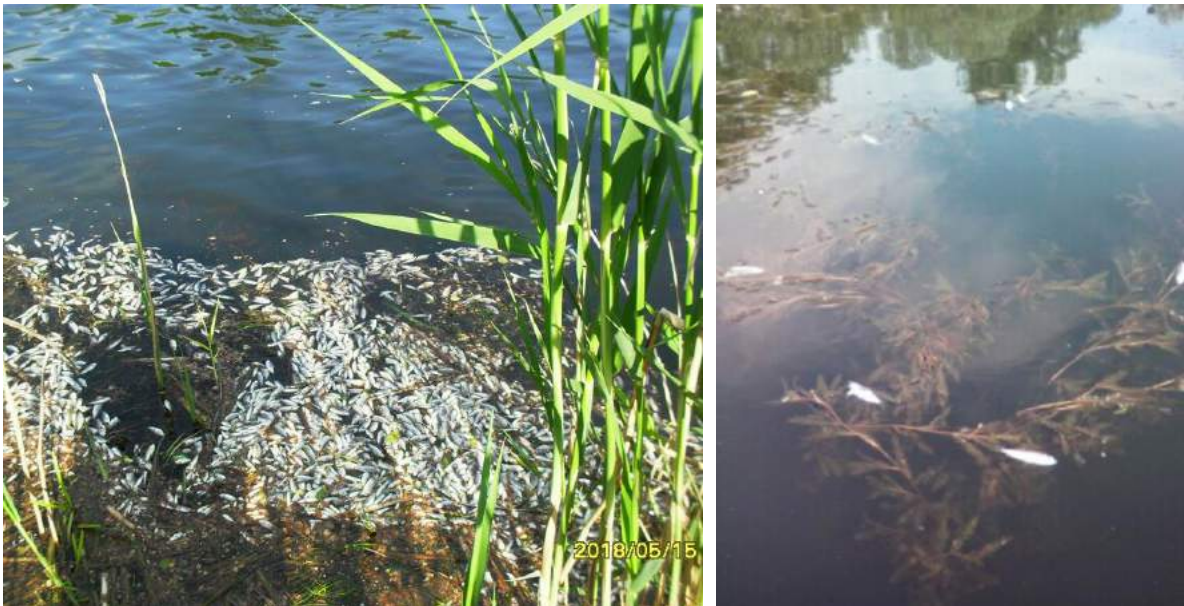
Community members reported seeing dead fish floating in the river near the outflow pipe of the wastewater treatment. Source: Facebook (see further Annex 6).

We are also concerned that other MHP practices may contribute to unknown pollution impacts, such as its use of pesticides and application of used water from poultry houses to irrigate crop land. For example, on 6 May 2017, a local resident witnessed pesticide spraying on a field leased and controlled by the Company across the road from her residence, at a distance of about 10 meters from her land and without prior notice to her. 131 Recently, on 4 May 2018, the same community member again noticed Zernoproduct Farm spraying pesticides close to her residence and without prior notice. This recent incident was again raised through a phone call to MHP's Corporate Social Responsibility team, and after that the spraying did eventually stop, but we fear such incidents may continue to occur. Community members fear that spraying of pesticides may lead to potential pollution of soil and groundwater, as well as unknown health impacts for local residents. Disposal of treated wastewater in the Pivdenny Bug River raises similar concerns. 132 For example, in May 2018 local community members noticed dead fish floating in the river near the outflow pipe of the wastewater treatment plant and we fear that this may have been related to the Company's operations. 133