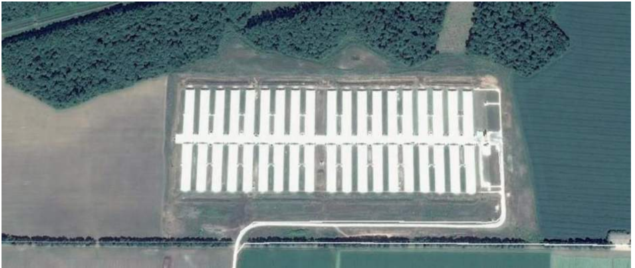
The typical brigade layout. Each brigade requires a total area of 25-30 hectares of land and can house approximately 39,060 chickens at a time. Source: 2016 OPIC Supplementary ESIA, p. 6, figure 2.3.

Each brigade consists of 38 poultry houses and has a capacity of approximately 1,484,280 chickens (broilers), meaning that there are currently as many as 17.8 million chickens being reared in the VPF at any one time. 18