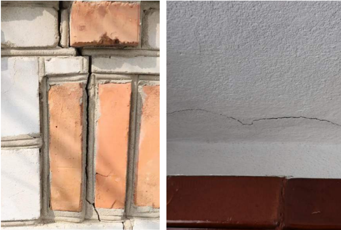
Cracks have appeared in recent years in residents' homes close to the road, both on building exteriors and along the walls and ceilings of interior rooms.

Impacts from MHP's heavy road use were foreseeable. In fact, MHP acknowledged them in meetings with community members in Olyanytsya in 2010. 101 Local residents have made numerous appeals for the immediate construction of the bypass road and other measures to address road impacts, dating back to 2012 or earlier. 102 In one such letter, community members in Olyanytsya again raised concerns about road impacts and presented a series of demands to MHP to address the issue, including construction of a bypass road, major road repairs, construction of sidewalks, speed limits, and an agreement not to construct any new brigades on Olyanytsya lands until these measures are carried out. 103 The Company and local officials agreed to implement all of the requested actions, 104 but to date, we have not seen any real progress.